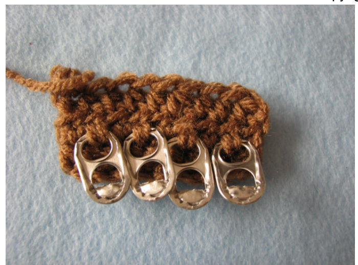
How to make a Double Pop Tab Half Double Crochet or DPTH. You have a row of PTH, next row you flip up the previous worked PTH, begin the hdc, insert the open end of the flipped up PTH