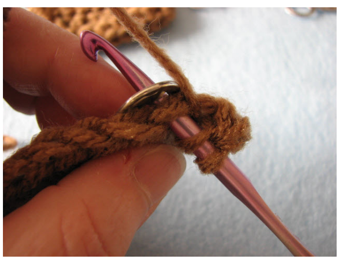
The place a second pop tab onto the hook, yo and finish the stitch.