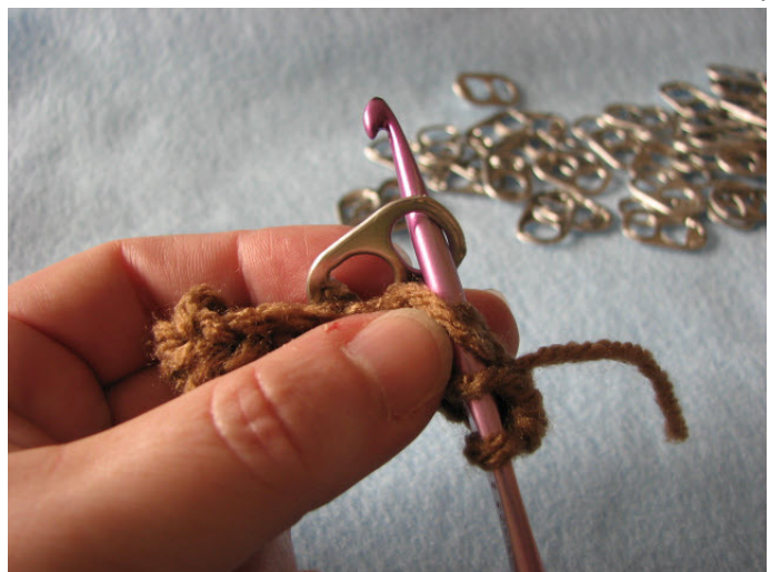
How to make a Pop Tab Half Double Crochet or PTH. Begin making a normal half double crochet, before finishing the stitch, slide on a pop tab, yo and then complete the stitch.