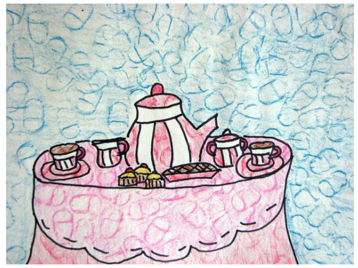
Would you like to have tea with us?